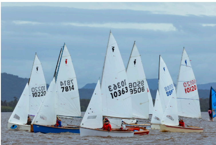
A great fleet of 40 Herons at the 2024 Jack Holt regatta and Queensland State Titles

competitor in the event, I was also involved in its organisation. I was blown away by the comments of fellow members of Lake Cootharaba Sailing Club. Everyone spoke warmly of the camaraderie and joy that was associated with the visit of the Heron sailors and almost all commented on the number of children participating as crews and skippers. Many also mentioned the close competition within the fleet and the complete (well nearly complete) lack of aggression on the water (they must have missed my little episode with an interfering 29'er close to the finish line in one heat for which I will be forever ashamed).