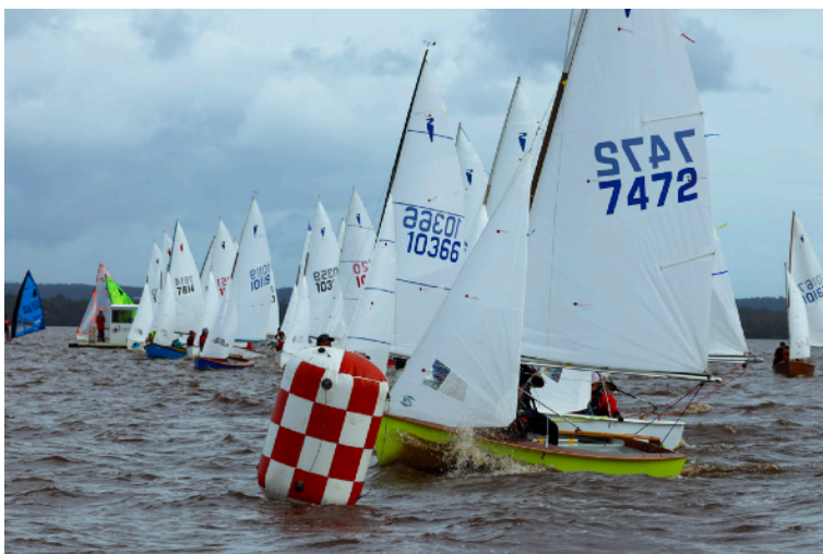
On the start line at the Queensland State Championship and Jack Holt Regatta.

As the recently appointed commodore of the host club for the Qld States, I had the benefit of a new perspective on Heron sailing. Not only was I a