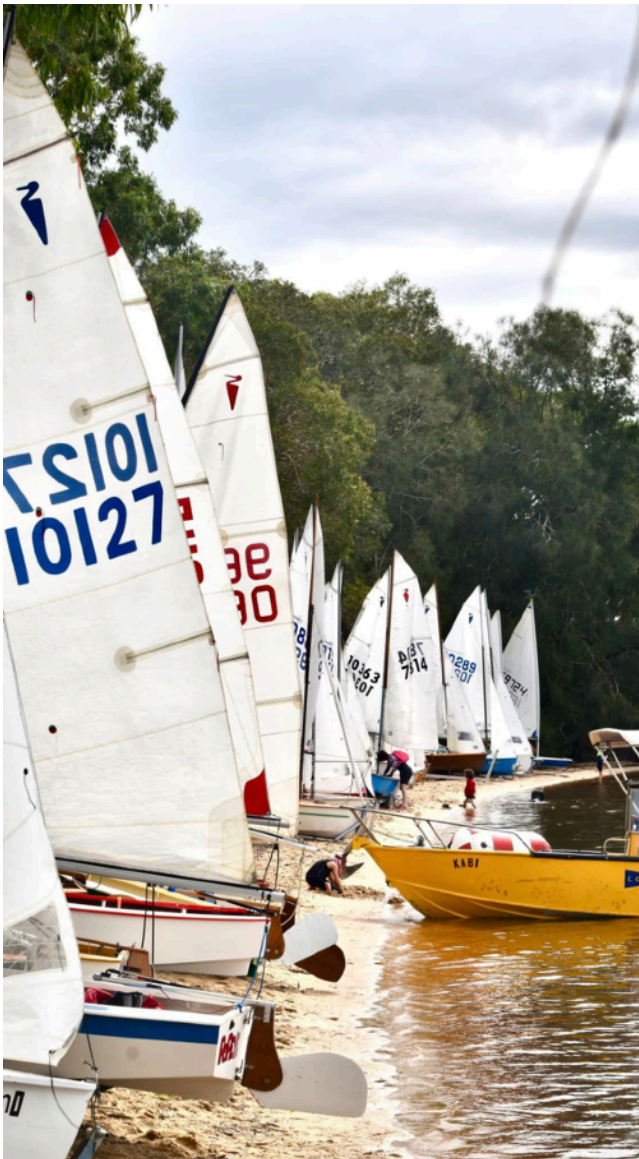
Hérons at Lake Cootharaba ready for the 2024 Jack Holt Regatta