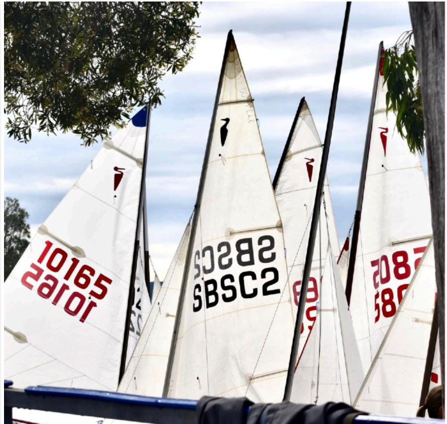
Hérons at the Lake Cootharaba Sailing Club for the Jack Holt Regatta.

Well, we've finally made it through to the off season and now have some time to reflect on what Heron sailing is all about.